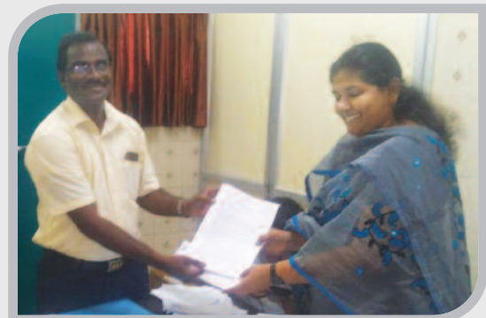
Acknowledgement letter received from the Block Medical Officer