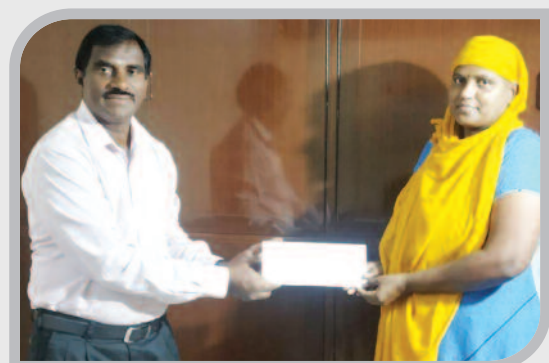
Village Health Nurse is getting Financial assistance for her Cancer Treatment.